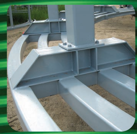
■ 24' - 4 ring 4 x 4 circular skid