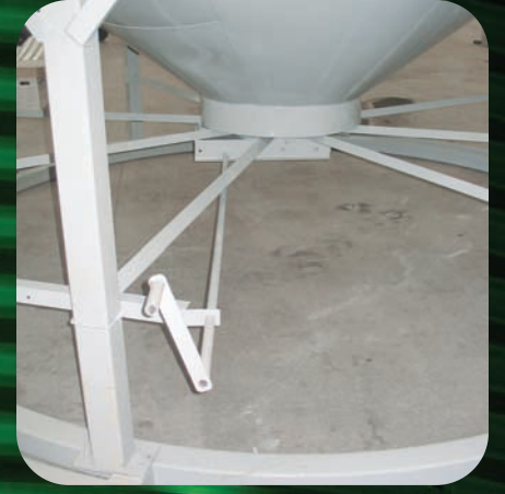
■ Rack and pinion gate available