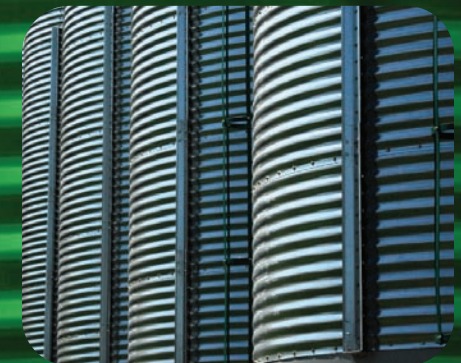
■ Heavy duty external stiffeners on all bins 18' and larger.