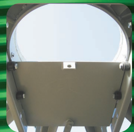
■ Slide gate glides on 6 nylon rollers