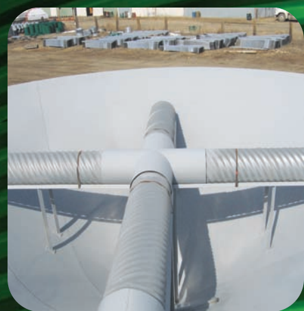
■ Cross air (standard in 21' and 24' cones)