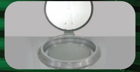
■ 24" inspection hatch optional