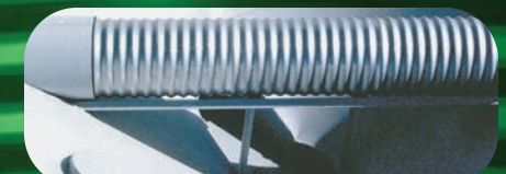
■ 18" or 24" aeration in 15' and 18' cones