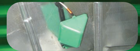
■ Saf-T-Fill Standard in all bins