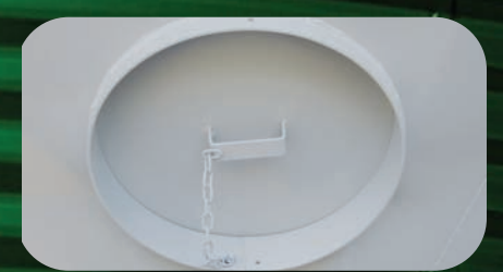
■ Manhole (22" circular manholes are standard on all Prairie Steel cones)