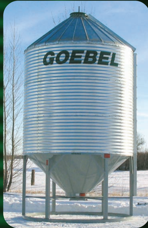
GOEBEL™ Feed Bins 330 bushels to 1360 bushels 9' to 12' diameter