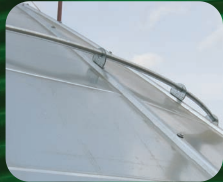
■ Roof Wind Brace on 24' diameter roofs