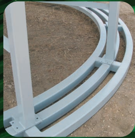
■ Heavy Duty Circular Skid (with the industry's largest footprint)

5 year standard warranty • 30 month paint warranty • Canadian Welding Bureau Certified