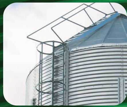
■ Safety cage and roof hand rail available for all GOEBEL™ bins ■ Ladder standard on all hopper bins