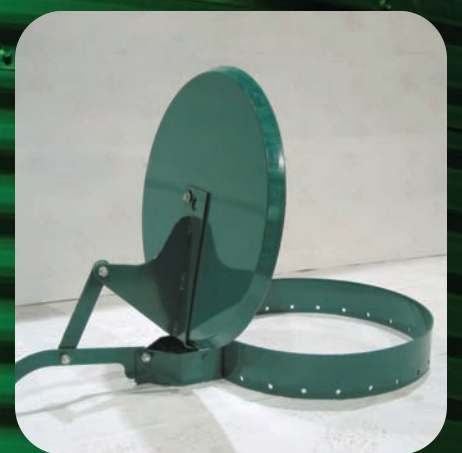
■ Remote lid opener